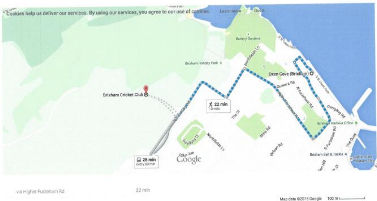
Oxen Cove (Brixham) to Brixham Cricket Club - Google Maps